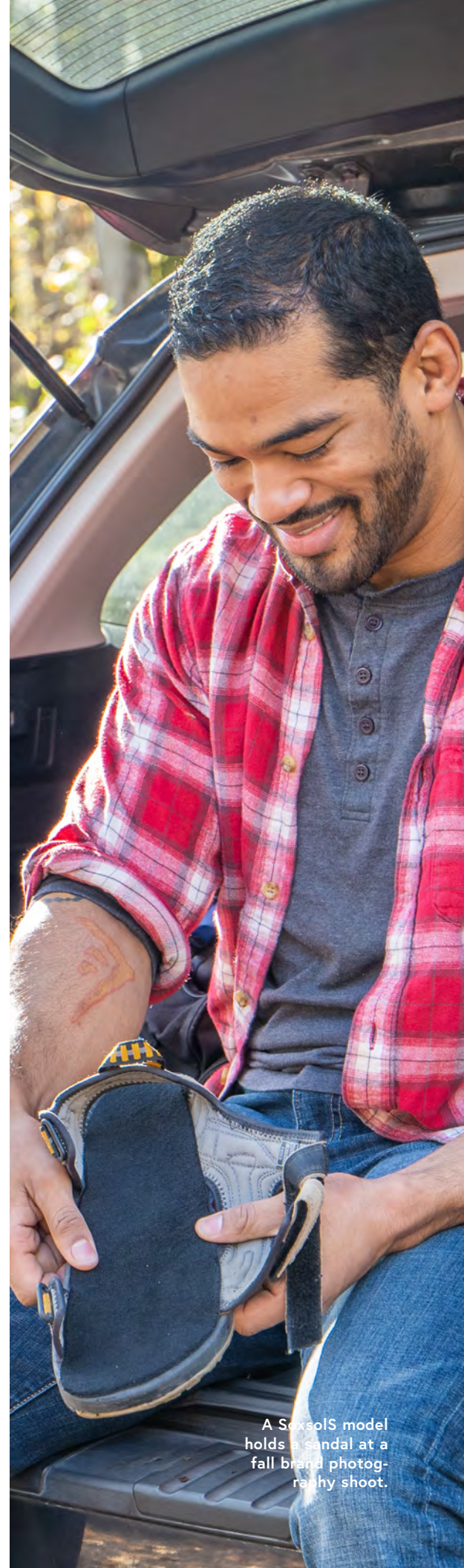
A SoxeoS model holds a sandal at a fall brand photography shoot.